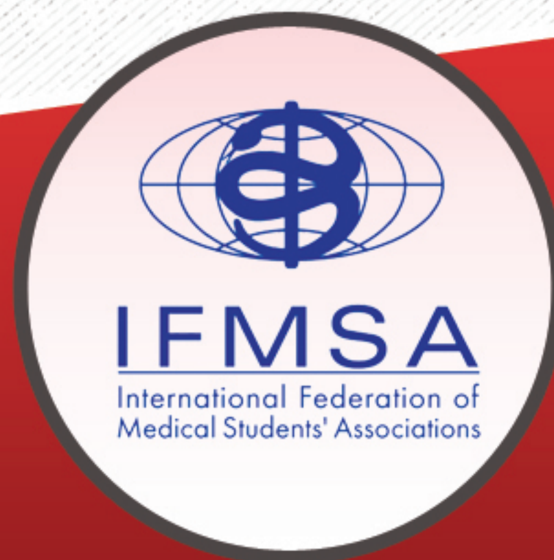
INTERNATIONAL FEDERATION OF MEDICAL STUDENTS' ASSOCIATIONS